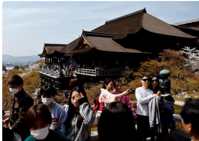
FILE PHOTO: A crowd of tourists are seen at Kiyomizudera temple in Kyoto, western Japan